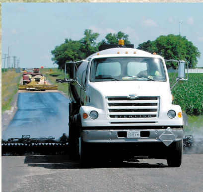
FULL CAB CONTROL

The total package – capable and dependable, the Etnyre Centennial Series asphalt distributor is built to stay solidly on the job year after year.