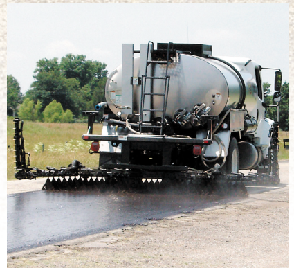
FASTER HEATING FASTER STARTS