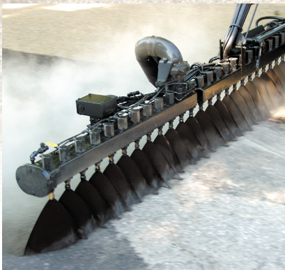
SOLID PIPE CIRCULATING SYSTEM