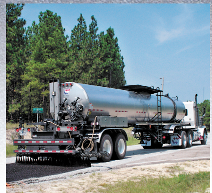
CUSTOM BUILT TANK SIZES