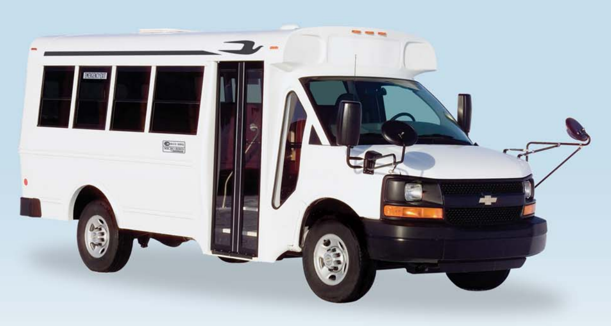
Multi-Function School Activity Bus Built to FMVSS/CMVSS School bus construction for your peace of mind.